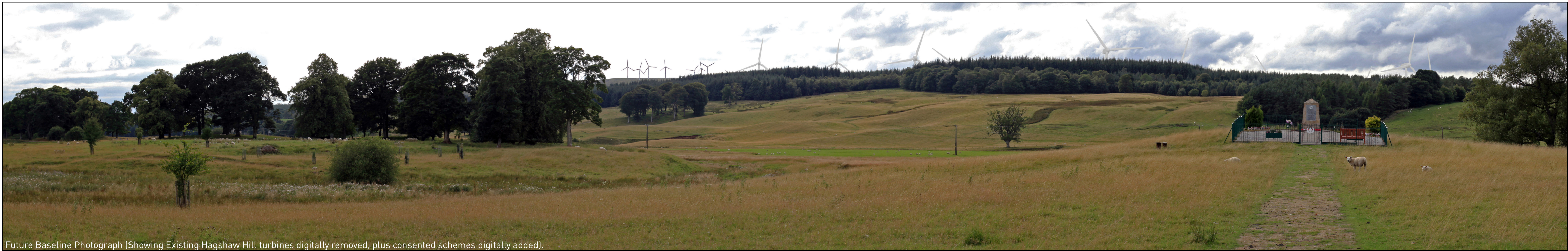
Future Baseline Photograph (Showing Existing Hagshaw Hill turbines digitally removed, plus consented schemes digitally added).