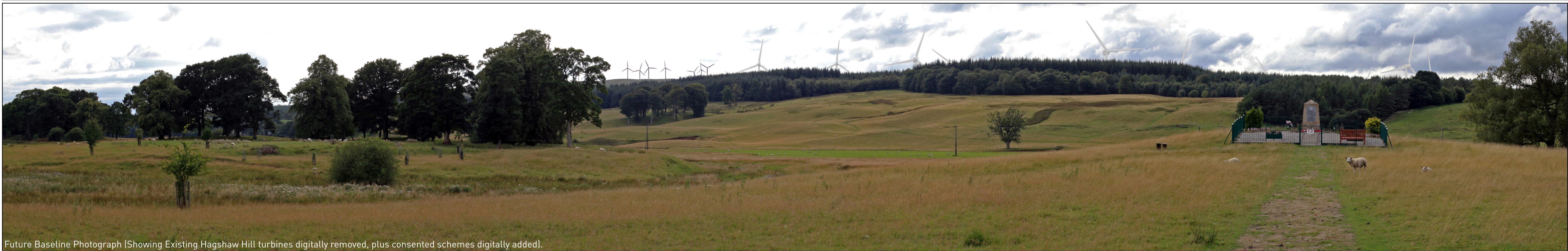
Future Baseline Photograph (Showing Existing Hagshaw Hill turbines digitally removed, plus consented schemes digitally added).