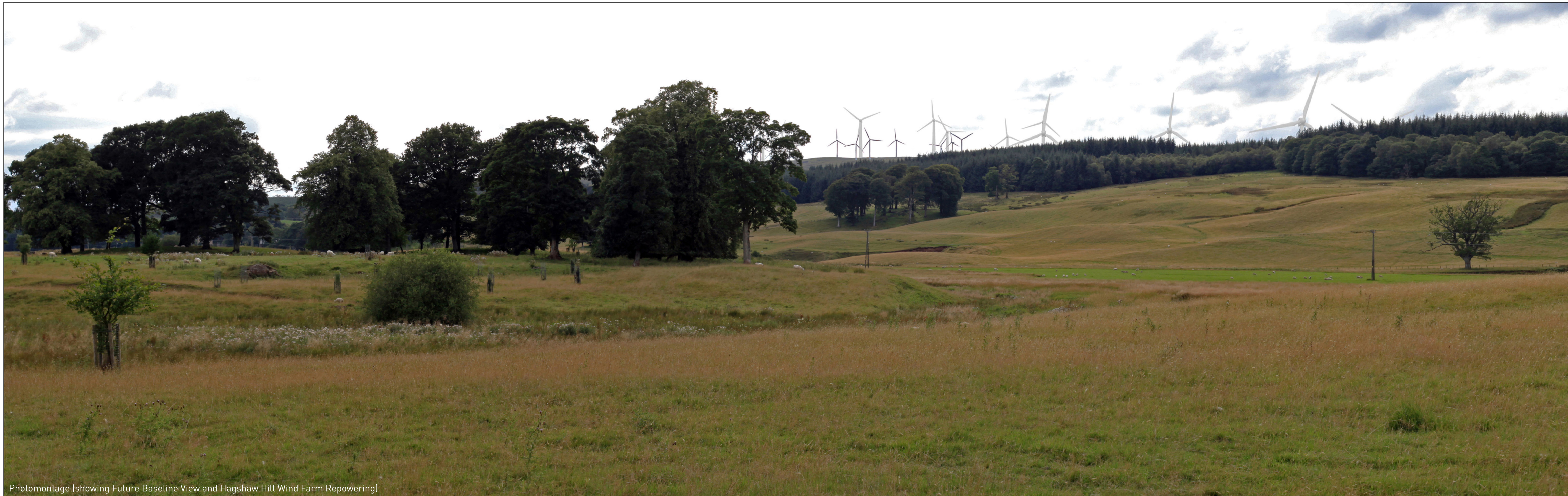
Photomontage (showing Future Baseline View and Hagshaw Hill Wind Farm Repowering)